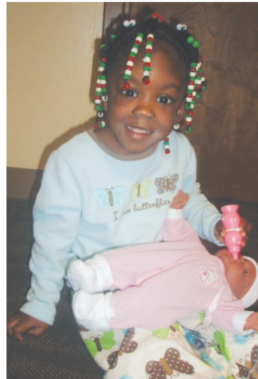
What's Christmas morning without toys? Friends like you make sure every girl and boy has gifts to unwrap.

The littlest residents of Joy House get into the spirit of Christmas by modeling their new PJs!