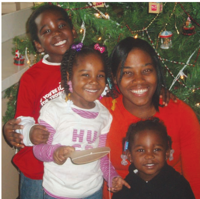
These joyful smiles outshine the brightest Christmas lights!