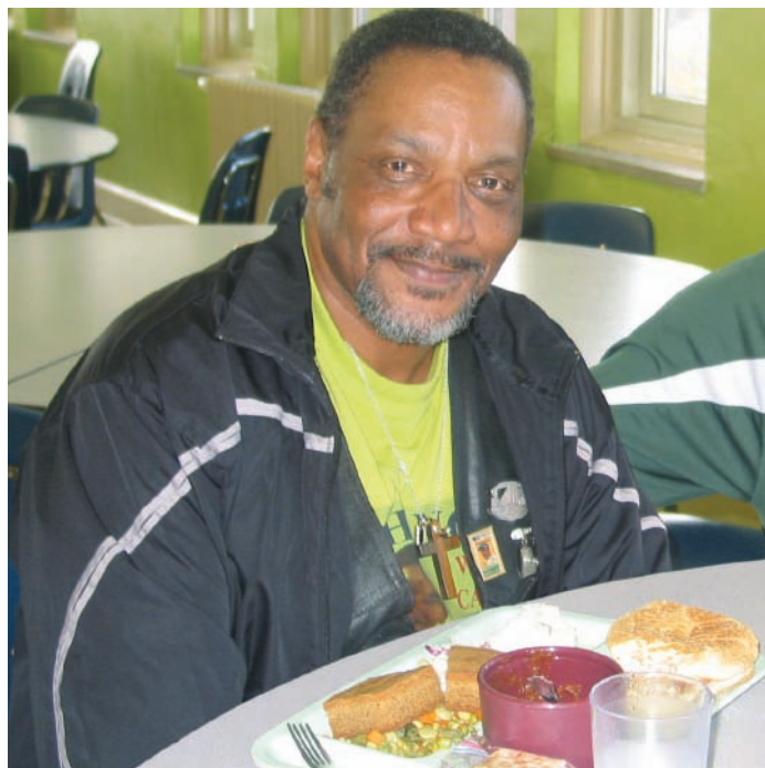
With platefuls like these, nobody leaves MRM hungry during the holidays and throughout the year!

Suddenly a great company of the heavenly host appeared with the angel, PRAISING GOD and saying, “GLORY TO GOD IN THE HIGHEST, and on earth peace to men on whom his favor rests.”