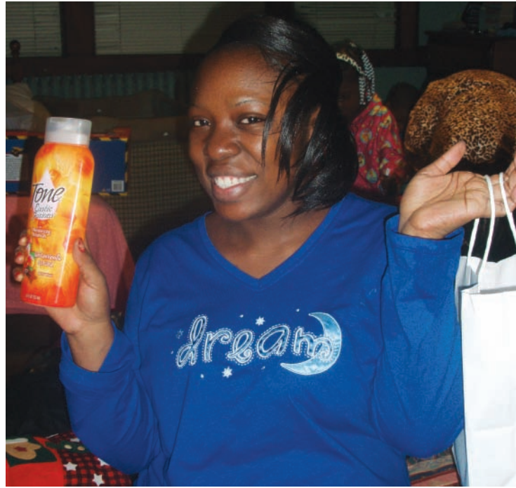
Every woman at Joy House feels special when she gets treated to personal Christmas gifts!

The littlest residents of Joy House get into the spirit of Christmas by modeling their new PJs!